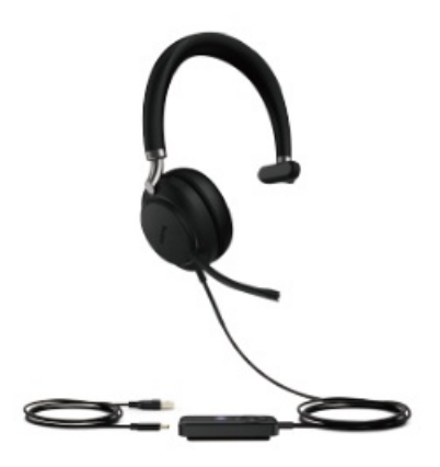
UH38 Mono Teams-W/O BAT UH38 Mono UC-W/O BAT